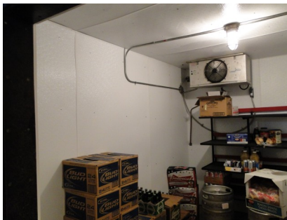
The newly updated walk-in cooler to meet health code requirements—Men's Auxiliary did the work.

If you have a particular skill, such as electrical, mechanical or even refrigeration, and are willing to support any of our maintenance needs, please provide me your contact information so we can use your help when the time comes—and we can work out a deal that would benefit both parties. Included are some pictures of our recent projects, so if we can keep the work in-