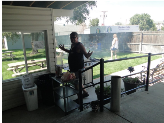
Our Sr. Vice cooking at the grill on Labor Day for our fundraiser