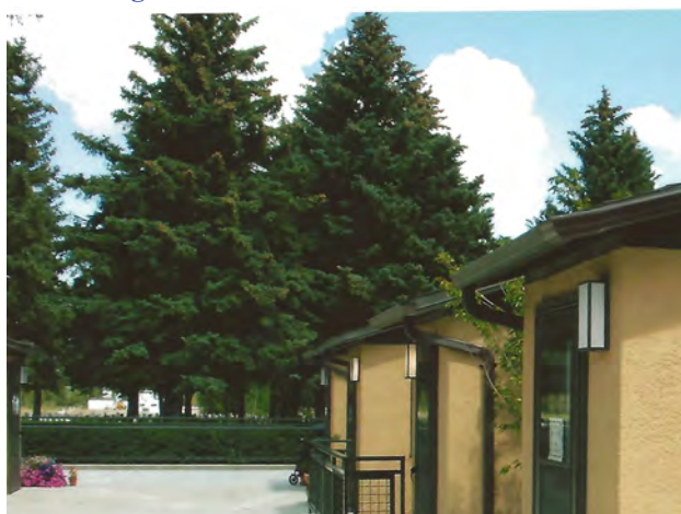
Homelake Domiciliary units have had a face lift. They really do look different and are much more comfortable and accessible for the residents.