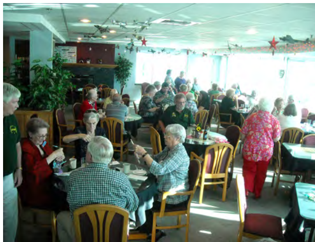
Everyone at the Homecoming enjoyed a meal of pasta dishes, salad and dessert. Relaxed and enjoyed the members that attended and watched the planes.