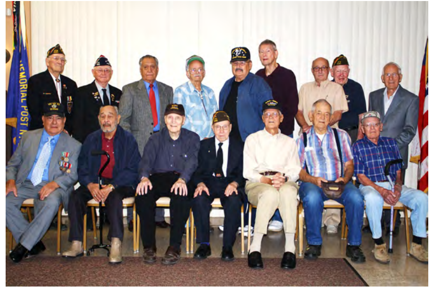
Dean K. Phillips Memorial #5061, Denver, World War II Veterans.