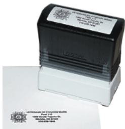
3712 address stamp