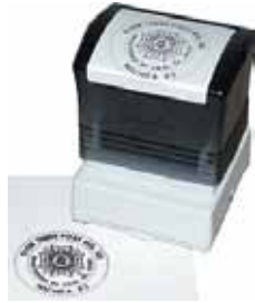
3711 VFW Seal