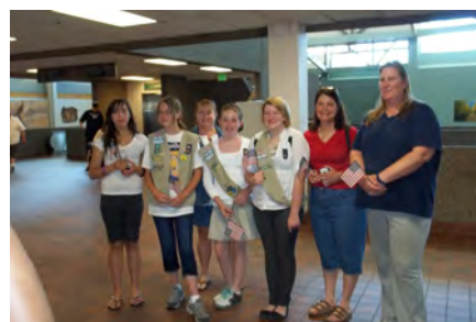
July 2, 2011 "Welcome Home" a Marine coming home from Afghanistan and also an Army man. Western Slope State Guard with Military Families of America at the Grand Junction Regional Airport.