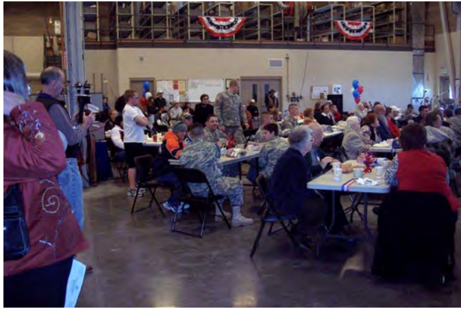
282nd Engineering Company was given a going away party for 21 Army Reserves from the Western Slope and their families before they left for Iraq. Western Slope will be looking after the families while the Reservists are away from home.