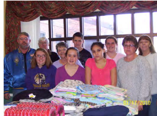
Members from Evans VFW Post 6624, Ladies Auxiliary and Jr Girls made their annual trek to the Cheyenne VA Nursing Home for the VAVS Post Holiday visit, January 17. Zipper jackets, pants, tee shirts, socks, ladies night gowns and robes along with a variety of fruit were delivered and also over 40 lap robes. If the resident could not make it to the dining hall the Jr. Girls were glad to go from room to room and spread a little cheer. Residents are very pleased when they take the time to sit and visit with them, so many organizations come to drop off items and leave. Thank you to each of you for always remembering the residents in Cheyenne.